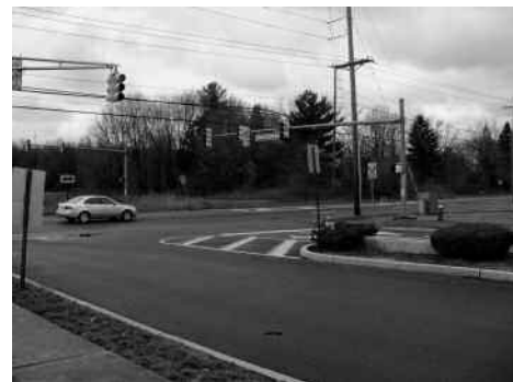
Lanning Boulevard and Princeton-Hightstown Road (County Route 571)

All engineering and construction costs will be funded from the Township Transportation Improvement Fund, consisting completely of developer contributions .