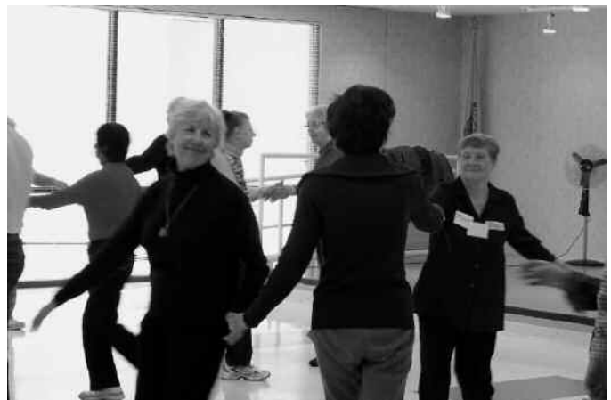
Seniors enjoy an afternoon of square dancing

The Wellness Initiative for Senior Education (WISE) Program celebrates healthy aging and educates older adults so they make positive lifestyle choices as they age.